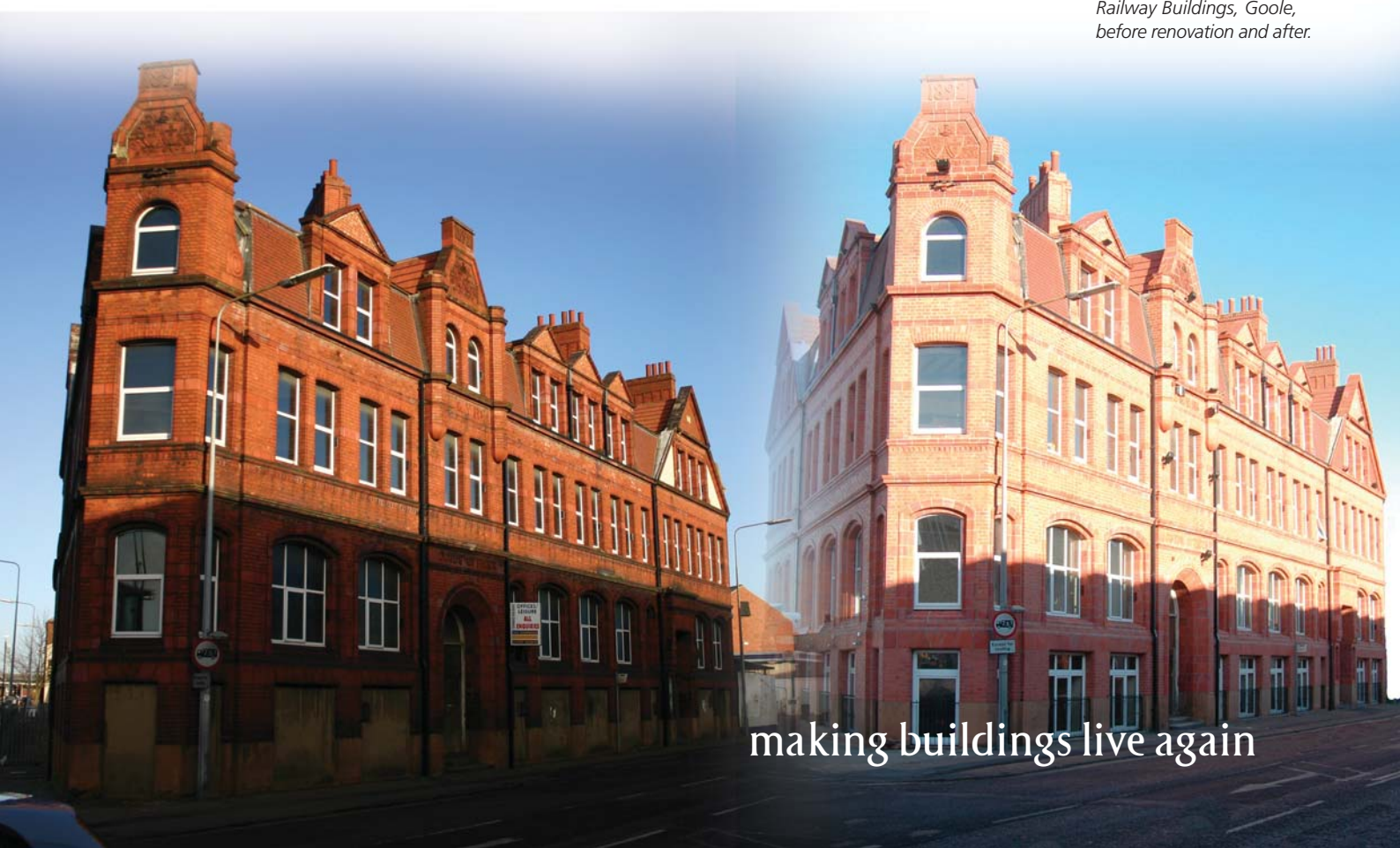
Railway Buildings, Goole, before renovation and after.

Before working together, they each ran a series of successful business ventures in the retail and leisure industries. Working together as The Julie Howard Partnership, they have a proven track record of applying their entrepreneurial spirit and vision to manage and deliver complex restoration projects that bring countless benefits to entire communities.