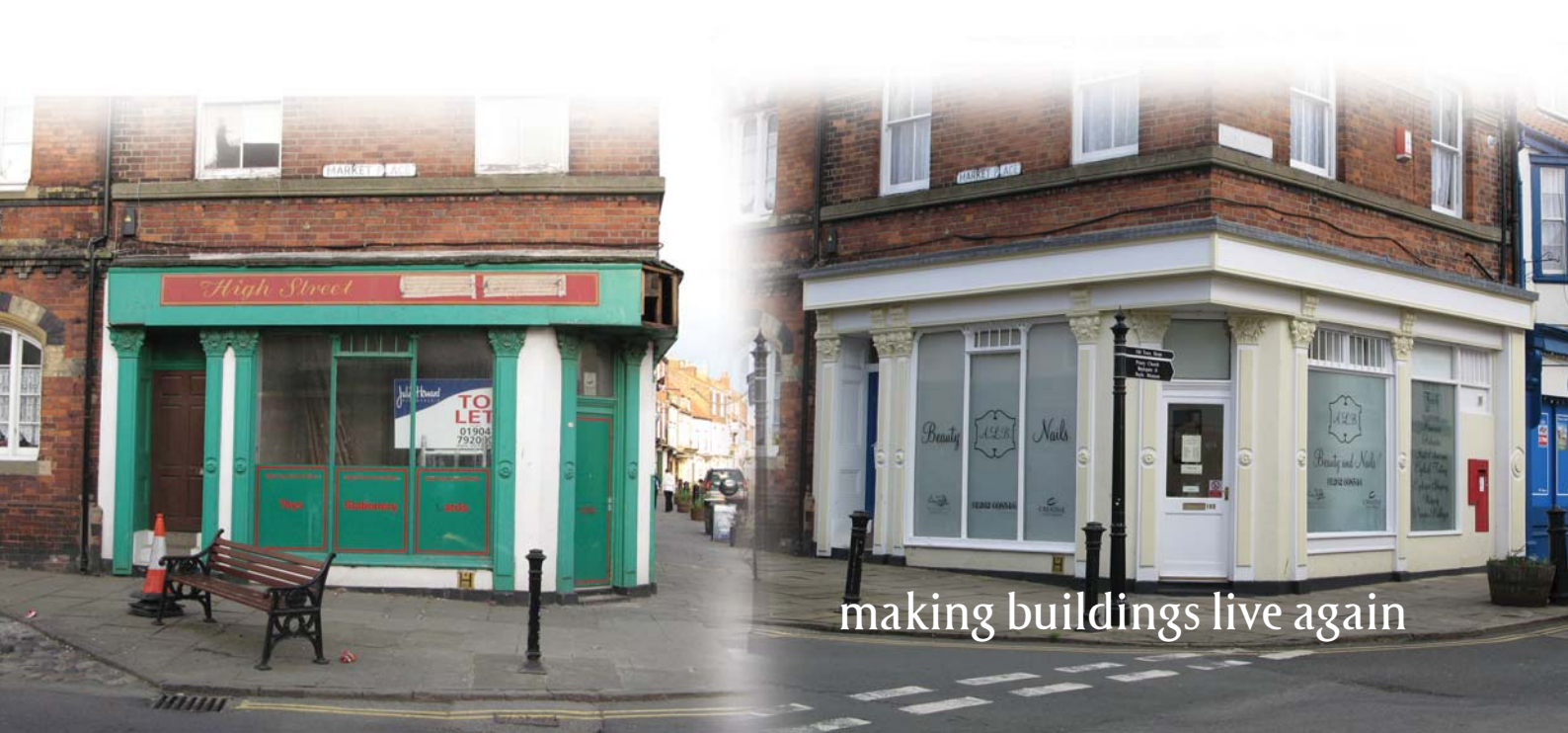
The Old Post Office, Bridlington Old Town before renovation and after.

Long before it became fashionable to be environmentally friendly, Julie and Howard were enhancing the appearance of the region's high streets by transforming derelict eyesores. The couple describe their activities as 'carbon-positive' - one step better than 'carbon-neutral' - because of the way that they re-use existing resources.